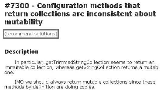
Figure 2. Change request details

Figure 2. In this screen the developer can analyze the change requests details, in many cases only the information of the summaries is not sufficient to inform the developer what he needs to start to solve the problem.